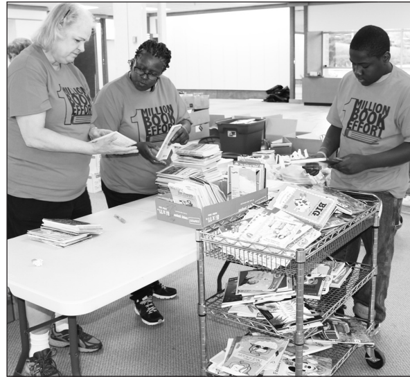
Volunteers sort books at the Rock Hill District's Book Processing May 31. The final processing is Tuesday at the civic center; sign up to help.

Volunteers are needed for Tuesday to receive, sort, package and place bookplates in each book to prepare them for distribution to organizations that work with children in poverty, from schools to tutoring and enrichment centers. To sign up, go to www.millionbookeffort.org and scroll down the list